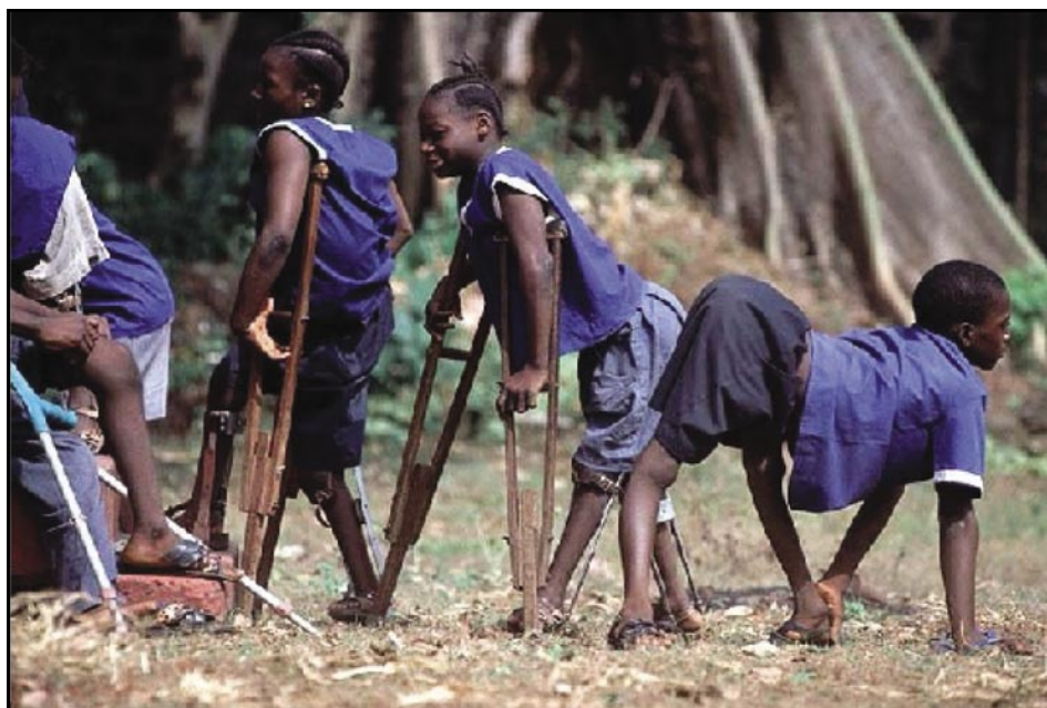
Polio survivors in Africa.

In 1985, after successfully eradicating polio in a project in the Philippines, Rotary launched its PolioPlus program to eradicate polio worldwide. Today, over a million Rotarians, joined by an impressive list of partners, are “this close” to eradicating polio in the world, seeing a 99% reduction in cases since the 1980s, fewer than 250 cases reported in 2012, and only 3 polio endemic countries left, conflict-ridden Afghanistan, Pakistan, and Nigeria. Over 2 billion children in 122 countries are now protected from polio. But, the risk of resurgence of the virus is real.